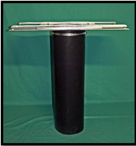
Safe Sleeve shown with PTFE Skirt