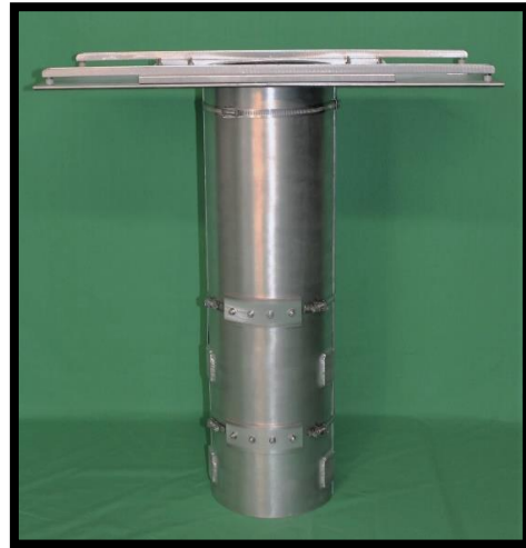
Safe Sleeve with Aluminum Skirt